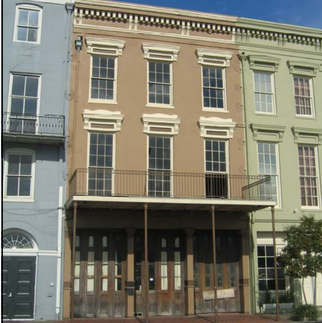
NORTH PETERS STREET SIDE