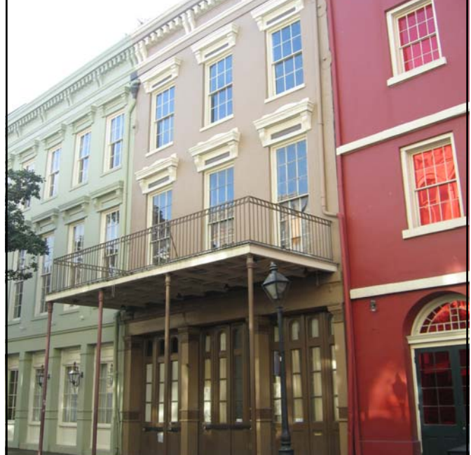
DECATUR STREET SIDE