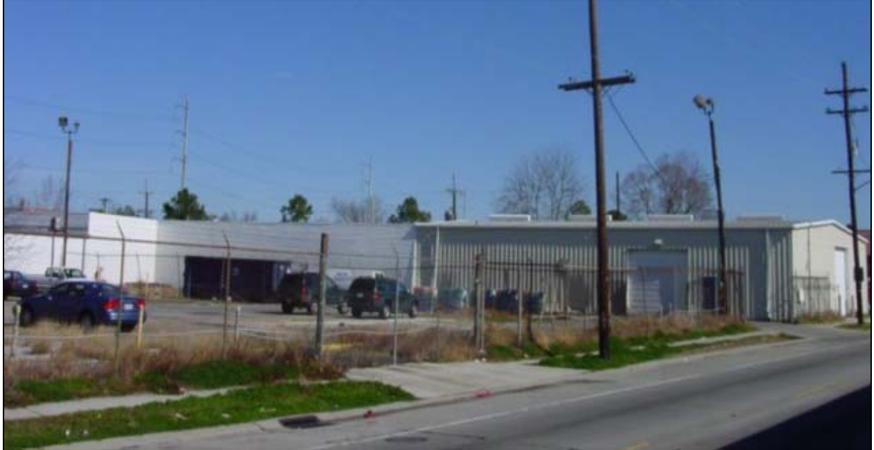
TCHOUPITOULAS STREET WAREHOUSE WITH YARD