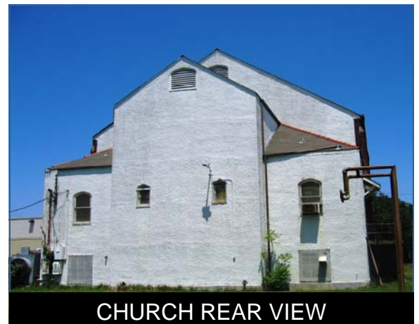
CHURCH REAR VIEW